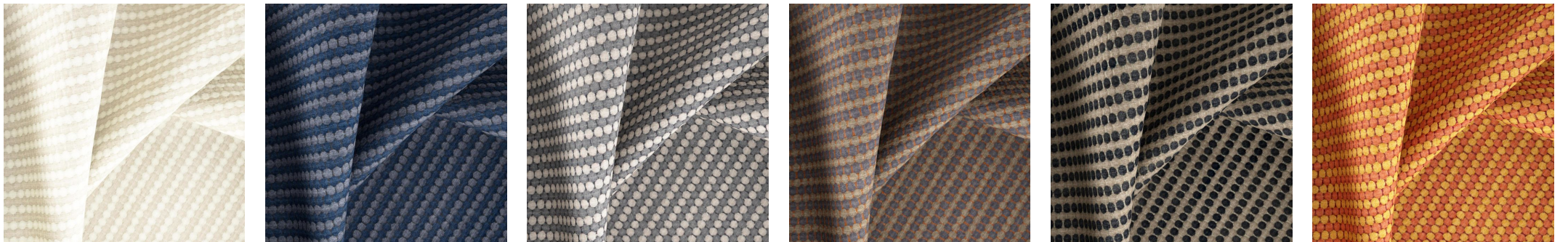
Cream Denim Feather Limestone Liquorice Sienna