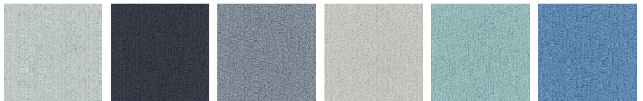
Cloud Ebony Iron Mushroom Reef River