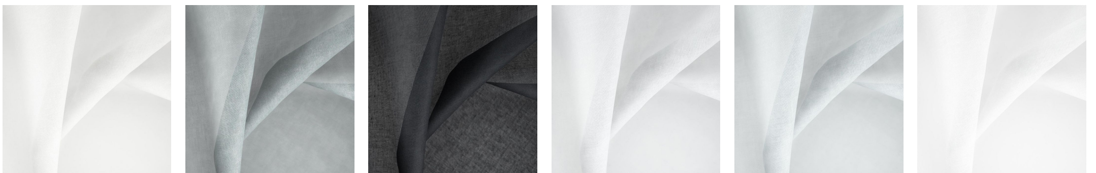
Marble Metal Onyx Silver Sky Snow