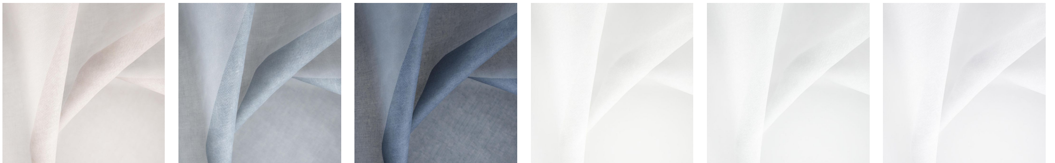
Blush Cadet Charcoal Cream Ecu Ice